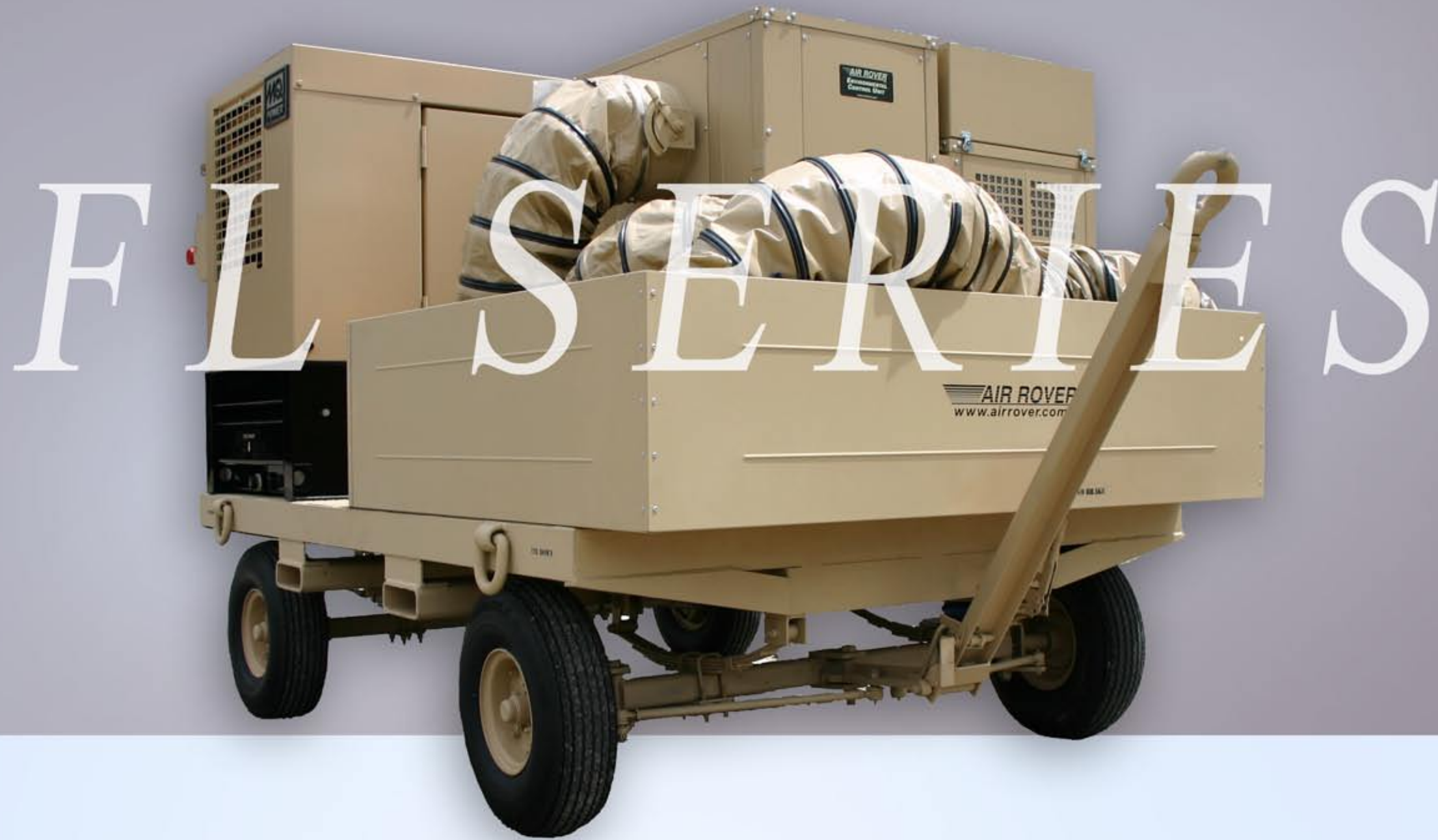
Flight Line Trailer-Mounted ECU & Generator

The FL Series flight line cooling system is an integrated trailer-mounted system complete with power generator, duct storage, ECU and power cable. The FL Series was developed for aircraft ground support cooling applications in high temperature environments of up to 150oF. Ultra silent generators are available in 20kW and 36kW and ECUs are available in 36,000 and 60,000 BTU/Hr in a single unit trailer-mounted arrangement.