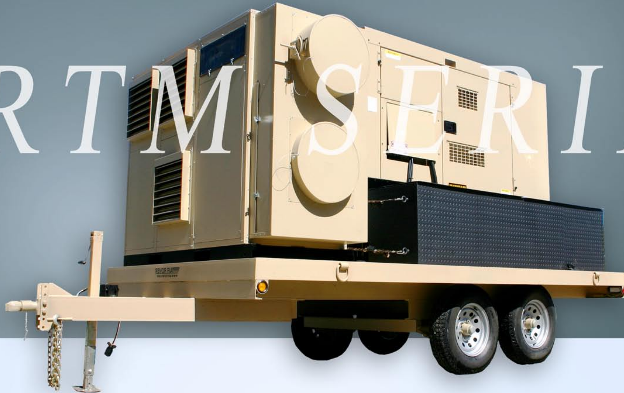
Air Rover Trailer-Mounted ECU & Generator